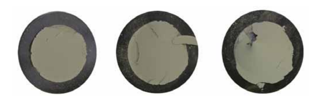
Fig.1: Pressed pellets of different lime samples several hours (~12 h) after the preparation exposed to room humidity. They burst after moisture uptake. Without the addition of HMPA 40 with a wax portion will burst even after some minutes.

pellet for XRF analysis. To avoid bursting of the sample it is recommended to use a waxy binder and store the sample in a dessicator immediately after pressing. Material loss inside the spectrometer is a possible risk which has to be minimized.