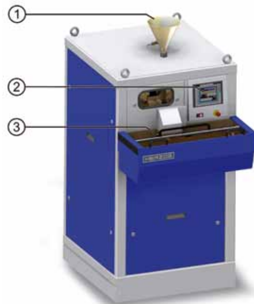
Fig.1: The automatic mill HP-MA configured for a combined cleaning with sand and compressed air.

This note will present main parameters of sample preparation and show the capability for processing samples with widely varying grades of copper on a single grinding machine.